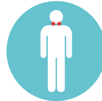
SWOLLEN LYMPH NODES