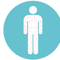
RASH, BUMPS, OR BLISTERS